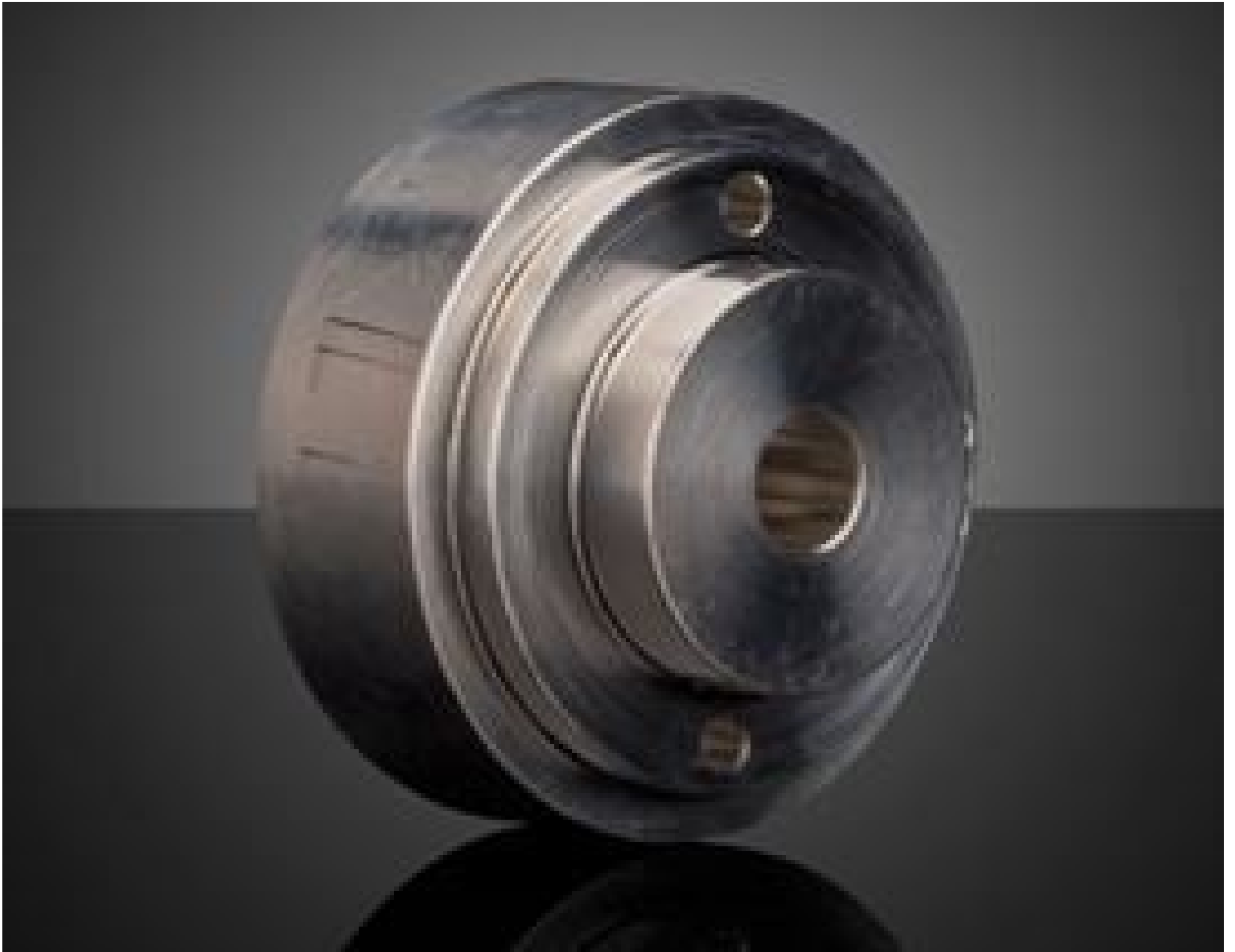
SugarCUBE™ Light Guide Adapter - 5mm (#13-537)