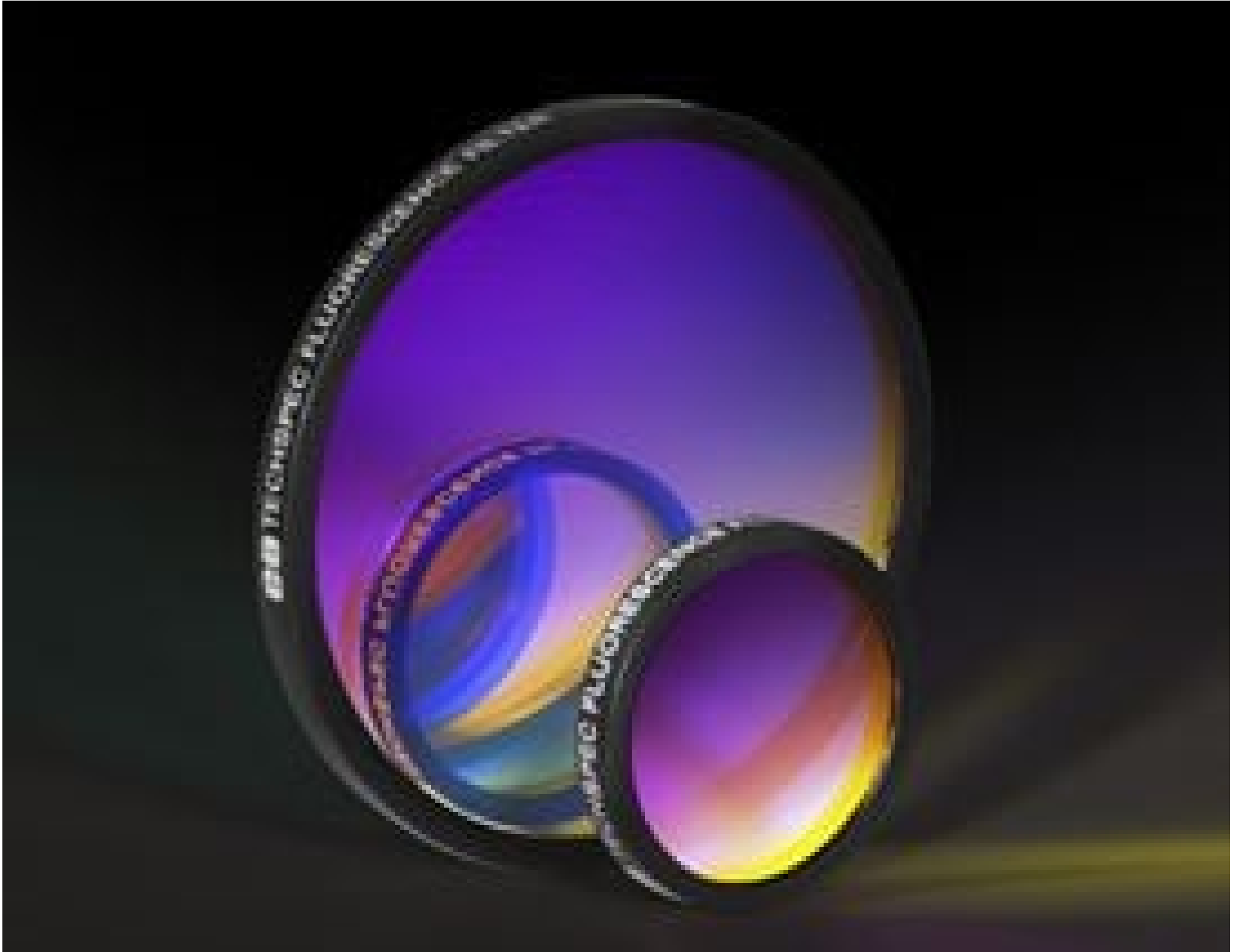
Multi-Band Fluorescence Bandpass Filters