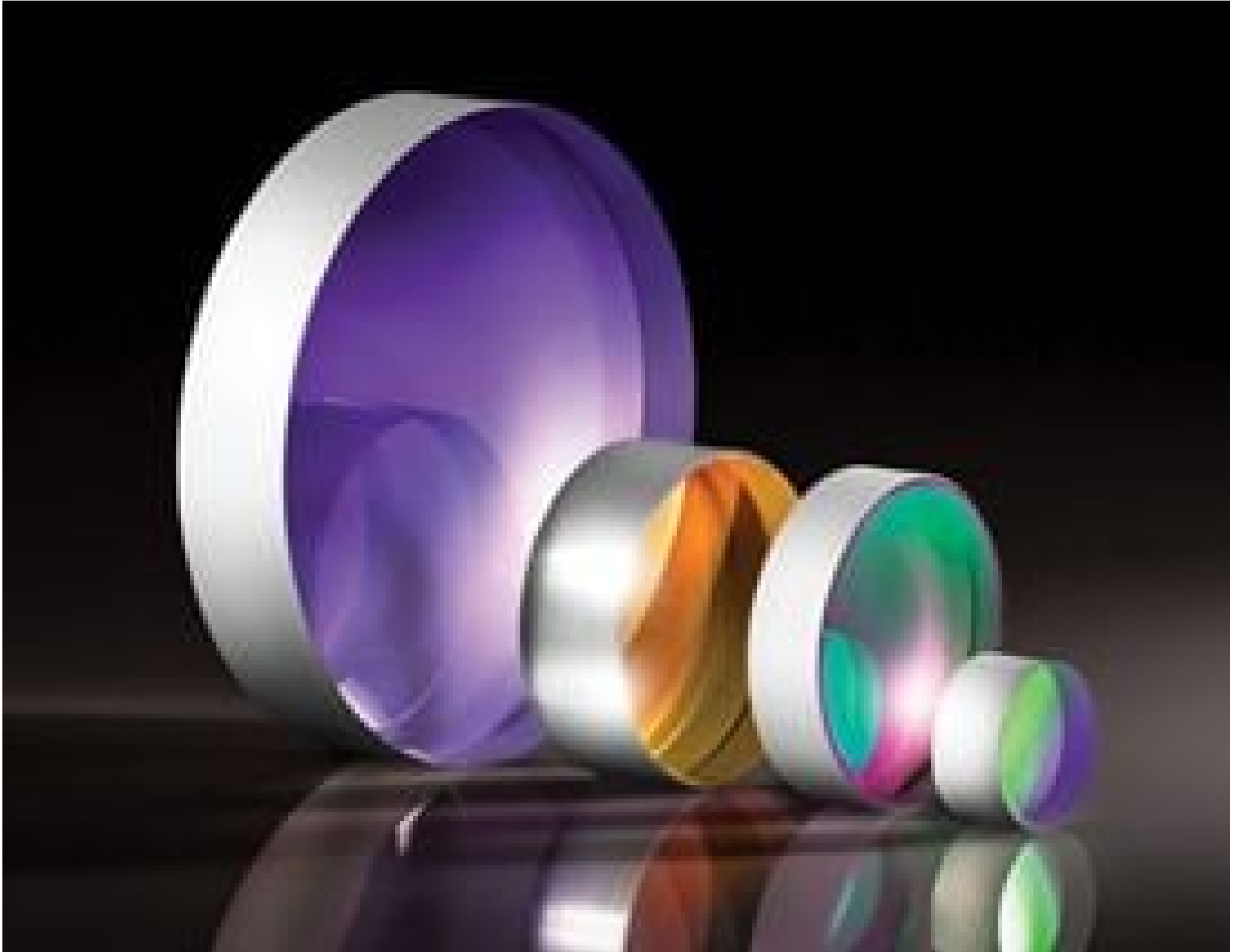
TECHSPEC® Nd:YAG Laser Line Mirrors